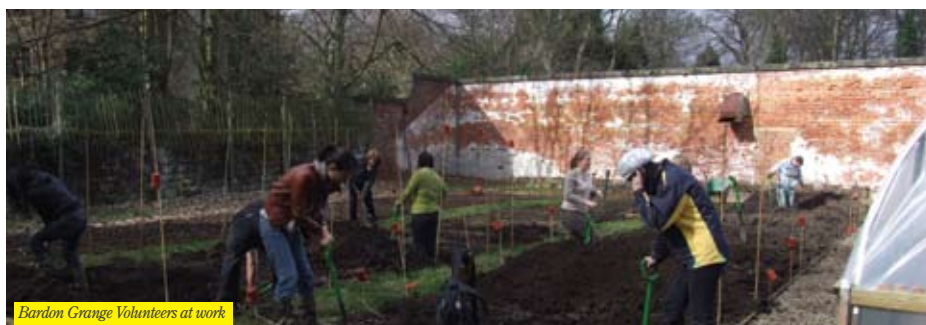
Bardon Grange Volunteers at work